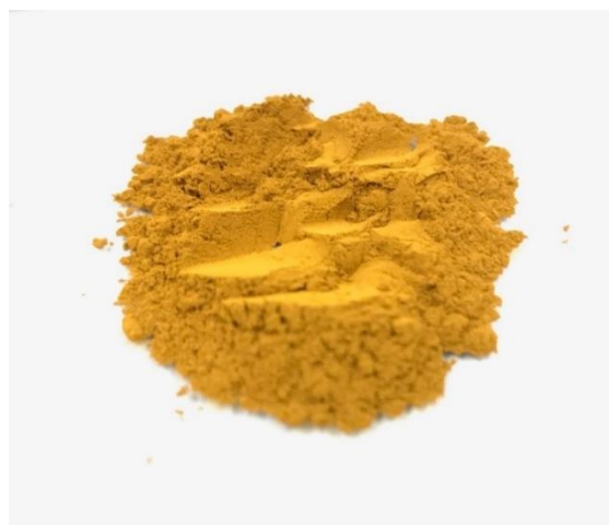
(Figure 2: Photograph of High Purity +99% V_2O_5 Product from Gabanintha)

Testwork, conducted by ALS Metallurgy Services, produced an ammonium metavanadate (AMV) precipitate from a leach solution and subsequently precipitated a V_2O_5 final product. The AMV precipitate, which was filtered from the remaining leach solution, delivered a >99% recovery of vanadium. The AMV precipitate was then calcined to generate a final V_2O_5 product (see Figure 2), with a purity in excess of 99%. Impurities within the final V_2O_5 consist of a small volume of alumina, chromium, potassium and sulphur.