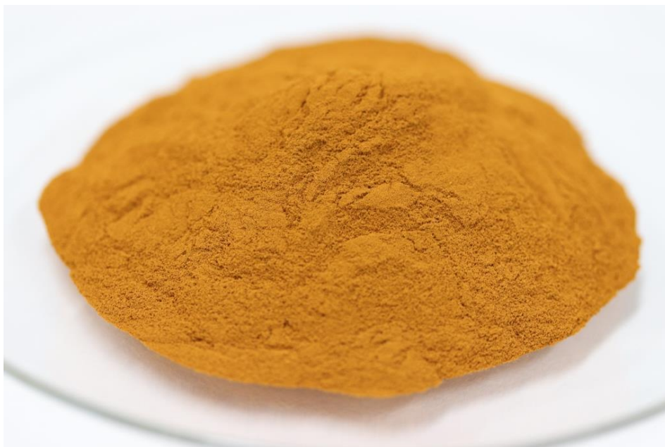
Figure 2: Photograph of High Purity 99.53% V_2O_5 Product from Gabanintha

The Company announced on 5 October 2018 and subsequent to the announcement on 28 September 2018, the issue of 12,000,000 fully paid ordinary shares ( Placement ) at a price of $0.50 per share to raise $6,000,000 before costs. The Placement Shares were issued under the Company's capacity pursuant to ASX Listing Rule 7.1 (6,747,750 Shares) and 7.1A (5,252,250 Shares).