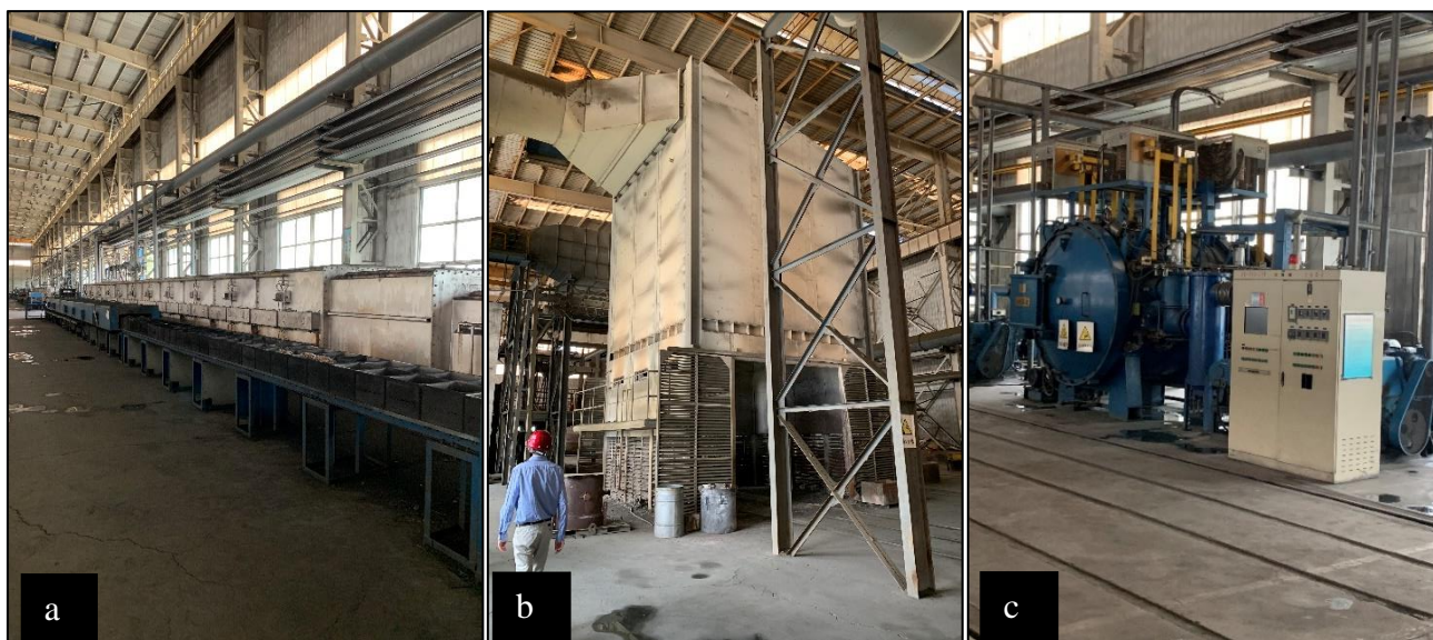
Figure 2: CNMNC's Vanadium Production Facilities

CNMNC operates six (6) state of the art vanadium-nitrogen push kilns, an example of which is shown in the figure 2 (a) below. It operates a separate ferrovanadium plant as shown in figure 2 (b) and has capability to produce vanadium metal in the chambers shown in figure 2 (c).